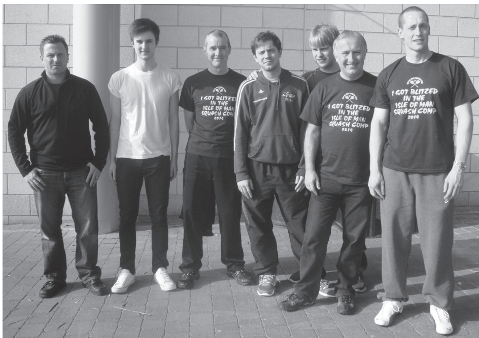
Above: Sedgefield Squash Club team - Isle of Man Runners Up 2014