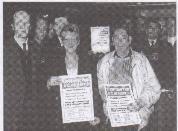
The Pub Watch launch in March 2000