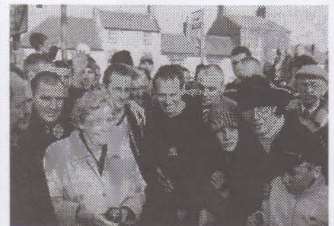
A smiling start to an earlier game

Newcomers to Sedgefield can be taken aback by events on Shrove Tuesday, so just in case there's anyone out there who doesn't quite know what to expect on March 4th, we've a little 'taster' for you.