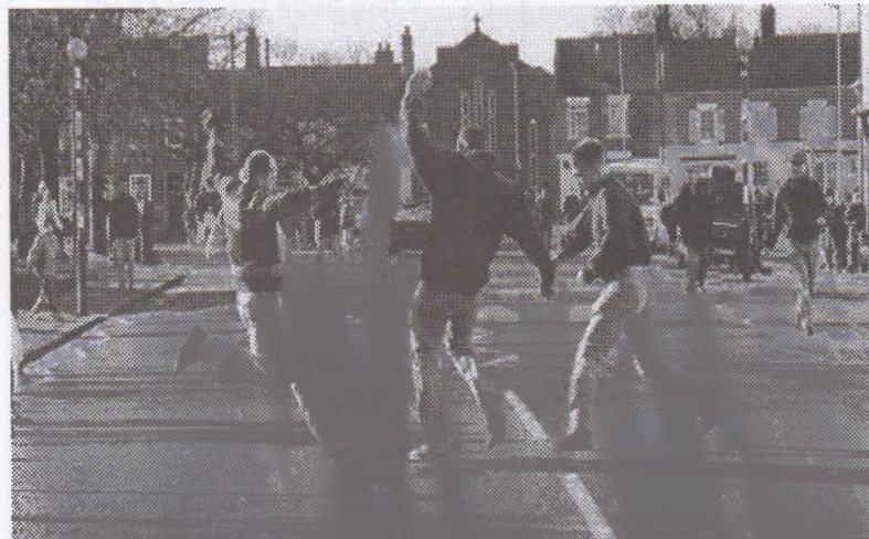
Auditions for the new ballet were going well!

When with pancakes ye are sated Come to the ring and ye'll be mated There this ball will be upcast May this game be better than the last