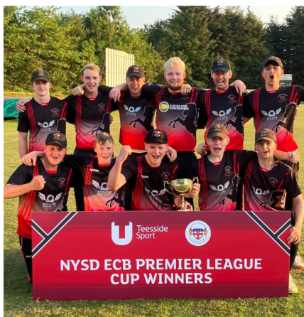
Sedgefield Cricket Club - winners of the 2023 Brunton Cup

It is great to see this young team - containing 10 players who've come through the junior ranks - winning silverware. This will undoubtedly encourage all of the club's youngsters to continue enjoying their development at Sedgefield. As the season nears halfway, Sedgefield is hopeful of more success to come.