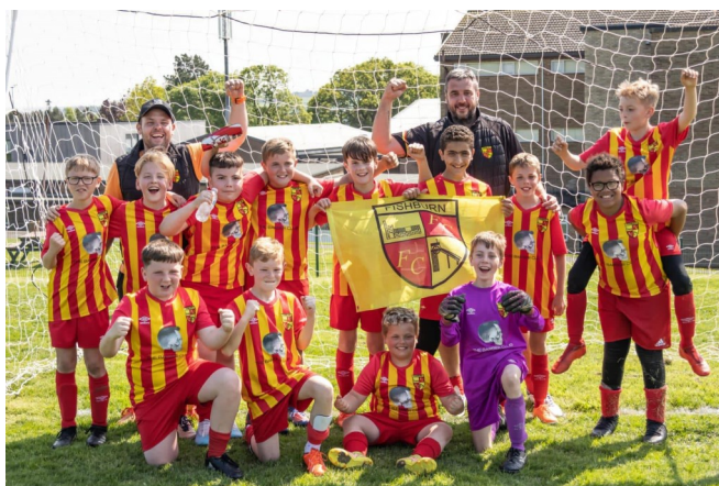
The trophy winning Fishburn Community FC U11s team

Congratulations to the Fishburn Community FC U11s team who recently won a tournament organised by Coxhoe United FC at the Sir Bobby Robson Sports Centre in Ushaw Moor, featuring teams from around County Durham. The event started with a round-robin league stage, with Fishburn winning three and drawing one game, which took them through to a semi-final against Coxhoe. After falling behind to two early goals, Fishburn fought back to edge the game 3-2 with a late winner. In the final, Fishburn faced Brandon, who they drew with in the group stage. This time around, Fishburn were on the front foot from the start and secured a 3-1 victory to claim their trophy. It was a great finale to the season for the team, who are now officially Fishburn Community FC U12s.