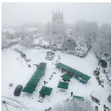
December's Farmers Market

A big thank you to all our volunteers who have helped in all weathers, without their hard work we would not be able to hold the Farmers Market. There will be fewer traders at the January market due to holidays and other commitments but there will be a lot of regular traders present, including the popular vegetable stall. So come along and support your local Farmers Market.