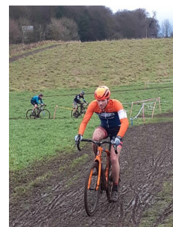
NECCL event, Sedgefield