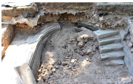
Elliptical bath in the Bath House by Geoff Hill

Without a full archaeological assessment of what remains, however, the next stage of seeking relevant statutory consents could not begin. It was therefore most encouraging to find that the bath remains virtually intact. Its design was a little unexpected since, until it was uncovered, it was thought it may have been tiled. It is in fact of stone, elegant and elliptical.