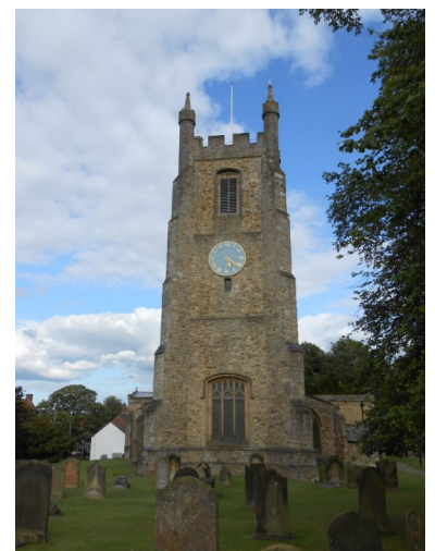
Artist's impression of the refurbished clock face