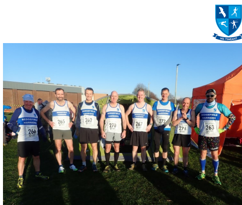
The Sedgefield Harriers senior men's team at the 2022 North Eastern Counties Cross Country Championships

The cross country season will continue in January with the Sherman Cup/ Davison Shield (back at Temple Park again), and then the final two fixtures of the North East Harrier League in February and March. After securing promotion last season, the Harriers' senior men are fighting to consolidate their place in Division 2 and currently sit in eighth place, a couple of places above the relegation zone, but only a few points below the teams in sixth and seventh. It's shaping up to be an exciting end to the season.