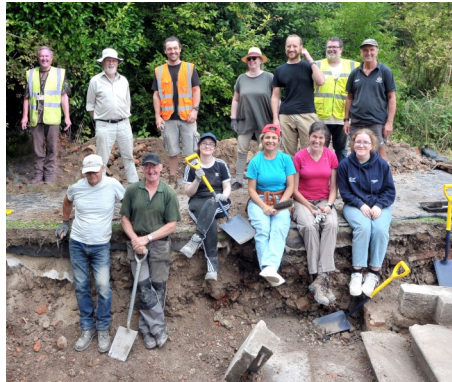
A dig team by Geoff Hill

Likewise, we had not expected to investigate all of the Banqueting House but the speed and efficiency with which the 24, mainly local, volunteers worked means that we were able to reveal the entire plan and locate the very deep foundations in several places. We also discovered some of the original, highly elaborate gilded plasterwork and even a lead mould, used by its 18th century creator, the talented Italian stuccoist, Giuseppe Cortese.