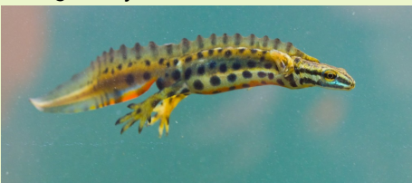
A male Smooth Newt with jagged crest

Before they breed, male Smooth Newts undergo a dramatic change of appearance. They change from looking lizard-like and grow a jagged crest which runs the full length of their body and tail and develop an orange belly.