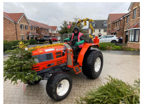
Sedgefield in Bloom collecting Christmas trees