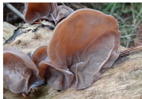
Jelly Ear Fungi at the Woodland & Wildlife site

We found evidence that the existing hedges are being used by many insects and are host to a number of interesting fungi, both of which play an important role in the ecosystems.